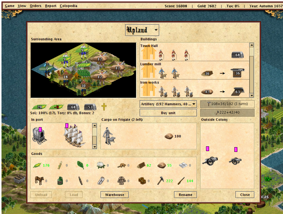
Figure 3.3: The Colony Panel

a different kind of work. If a tile has a red border, then it is being used by another colony or settlement. Please note that you can not use water tiles until you have built docks .