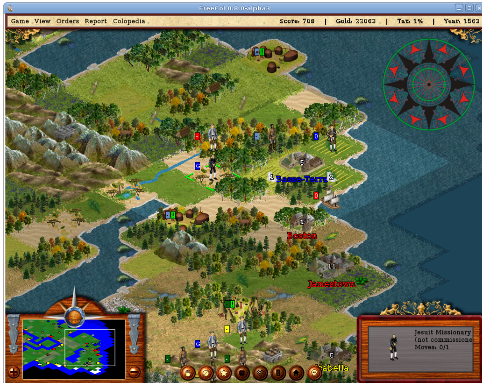
Figure 3.1: The main screen.