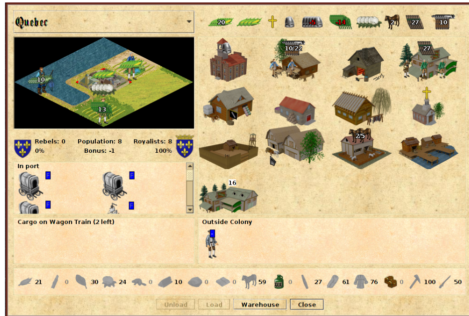
Figure 3.3: The Colony Panel

work in buildings, defend the colony against attackers or wait outside of the colony.